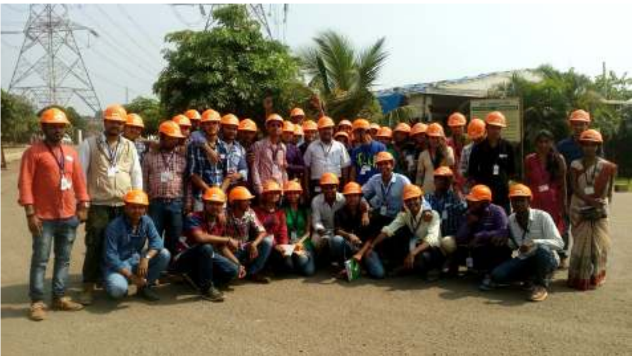
7 th sem E&E students along with the faculties at JSWEL 1200 MW plant at Ratnagiri, Maharashtra