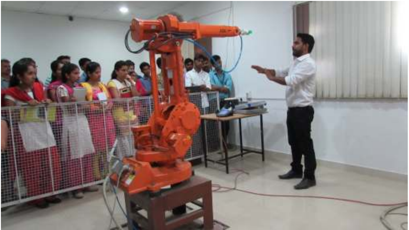
VIIIsem E&E students along with the faculties visited ACS at Pune, Maharashtra