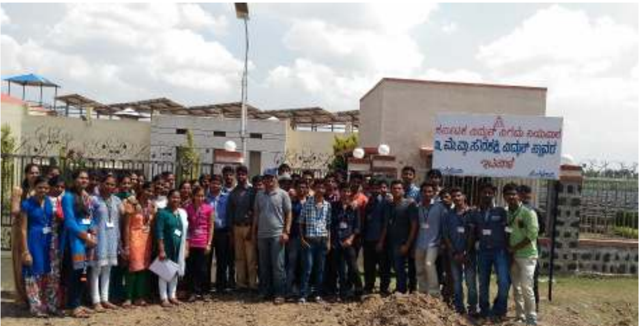
3MW Solar power plant, Itnal (Tq: Chikkodi, Dist: Belagavi) visited by 5 th sem students on 28 th Sep.