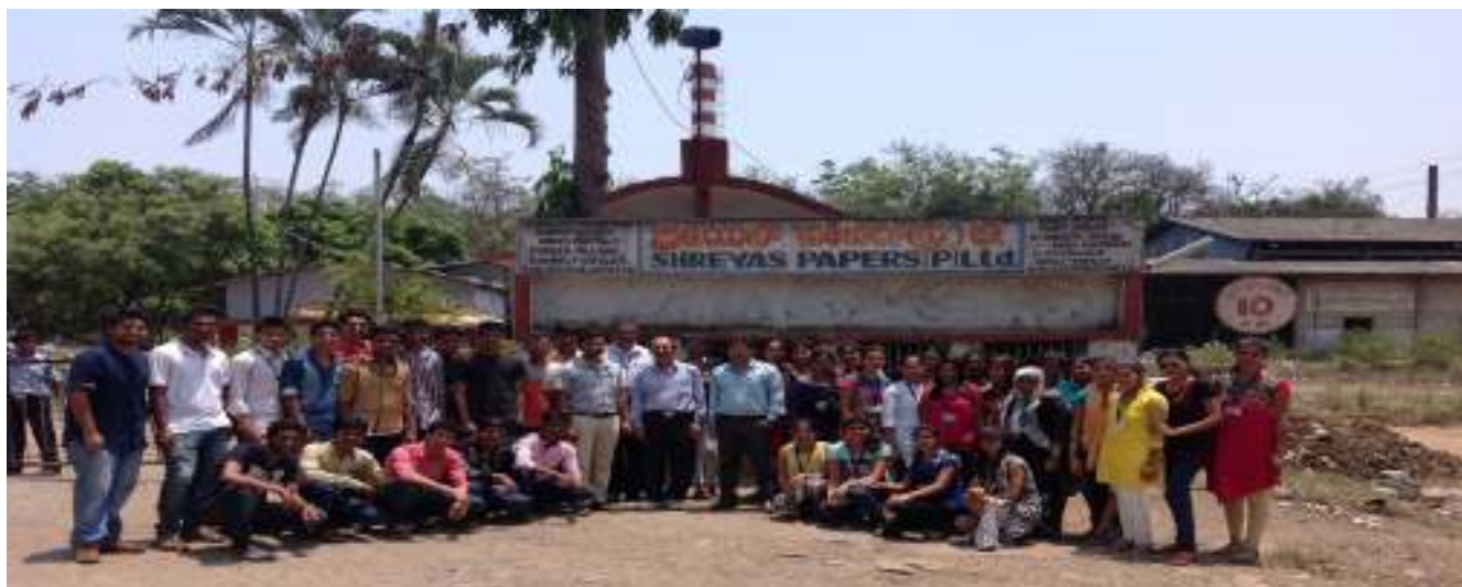
IV sem E&E students along with the faculties visited Shreyas Papers Pvt. Ltd., Dandeli

Industrial tour was arranged for IV semester students on 16/04/2016. Students have visited Shreyas Paper Mill which is supplier and manufacturer of distributor of duplex board, craft board, craft paper, color board.