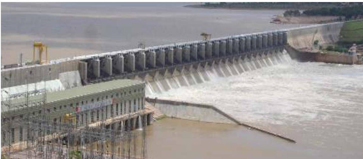
290MW Almatti Hydro power plant visited by 3 rd sem students on 19 th Sep.