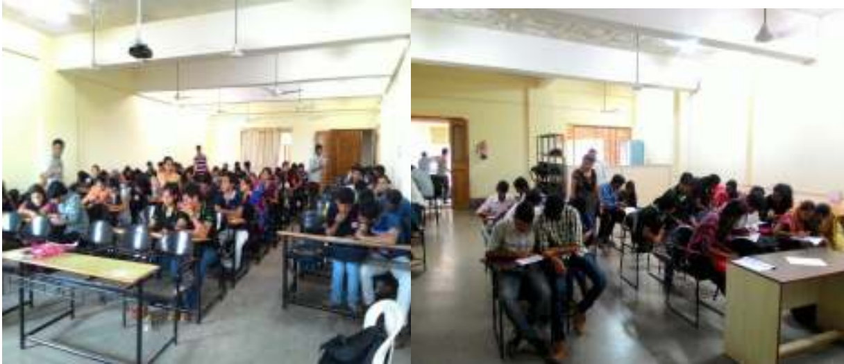
Students participated in First round of the Quiz