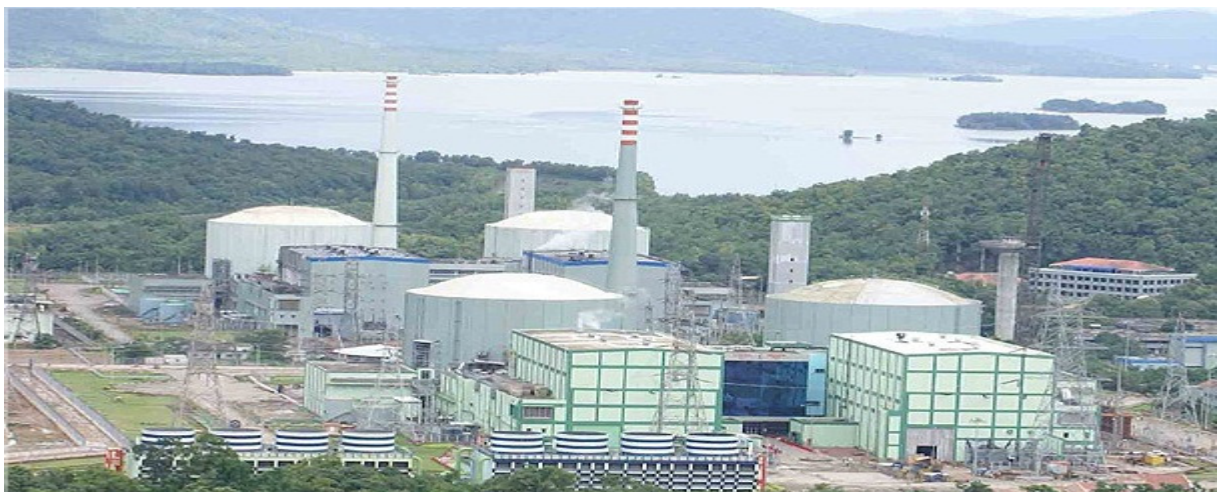
880MW Nuclear power plant, Kaiga visited by VI sem students on 2 nd April

Project: This nuclear power plant has capacity of 880MW.