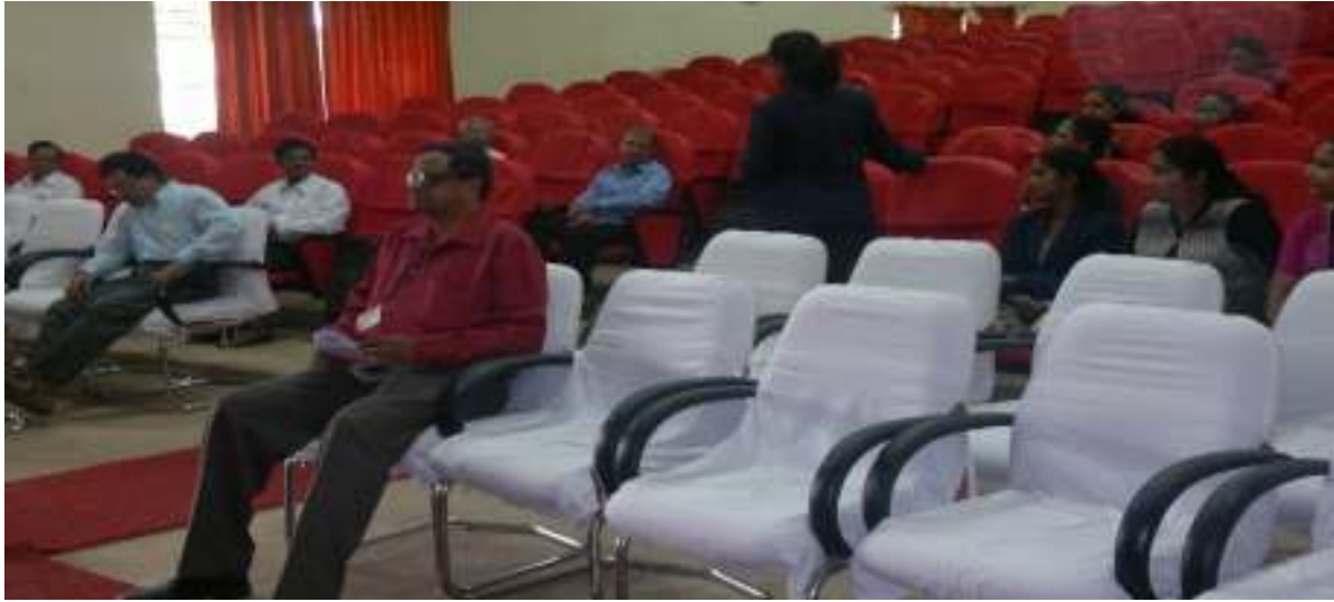
The EEE staff faculties interacting with parents