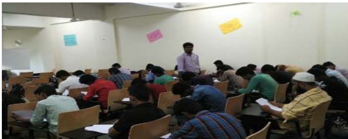
Students writing in Aptitude Test