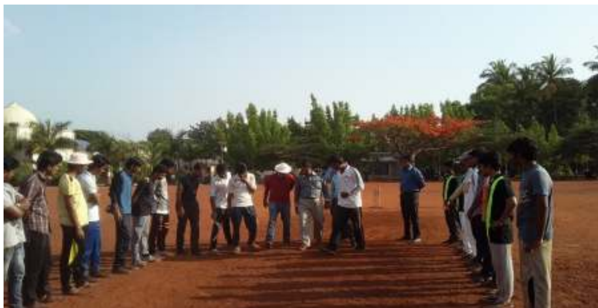
Final Match of Sagar Cricket Trophy-2016