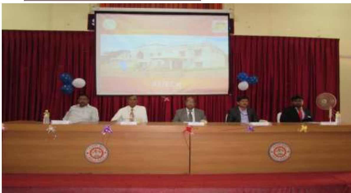
Valedictory Function of AETECH 2015-16