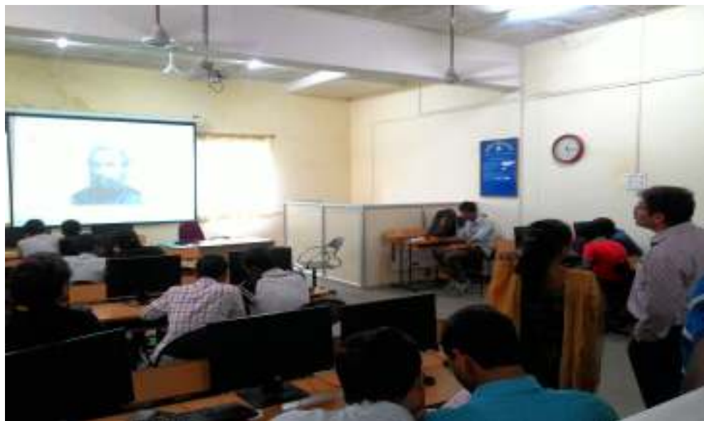
Students participated in Final round of the Quiz