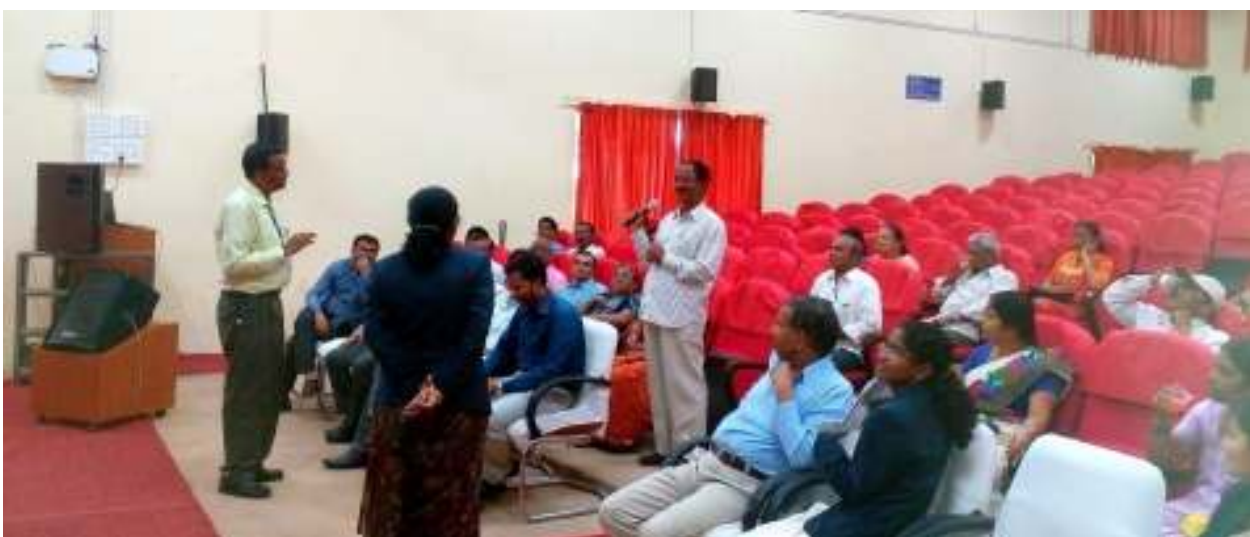
The EEE staff faculties interacting with parents