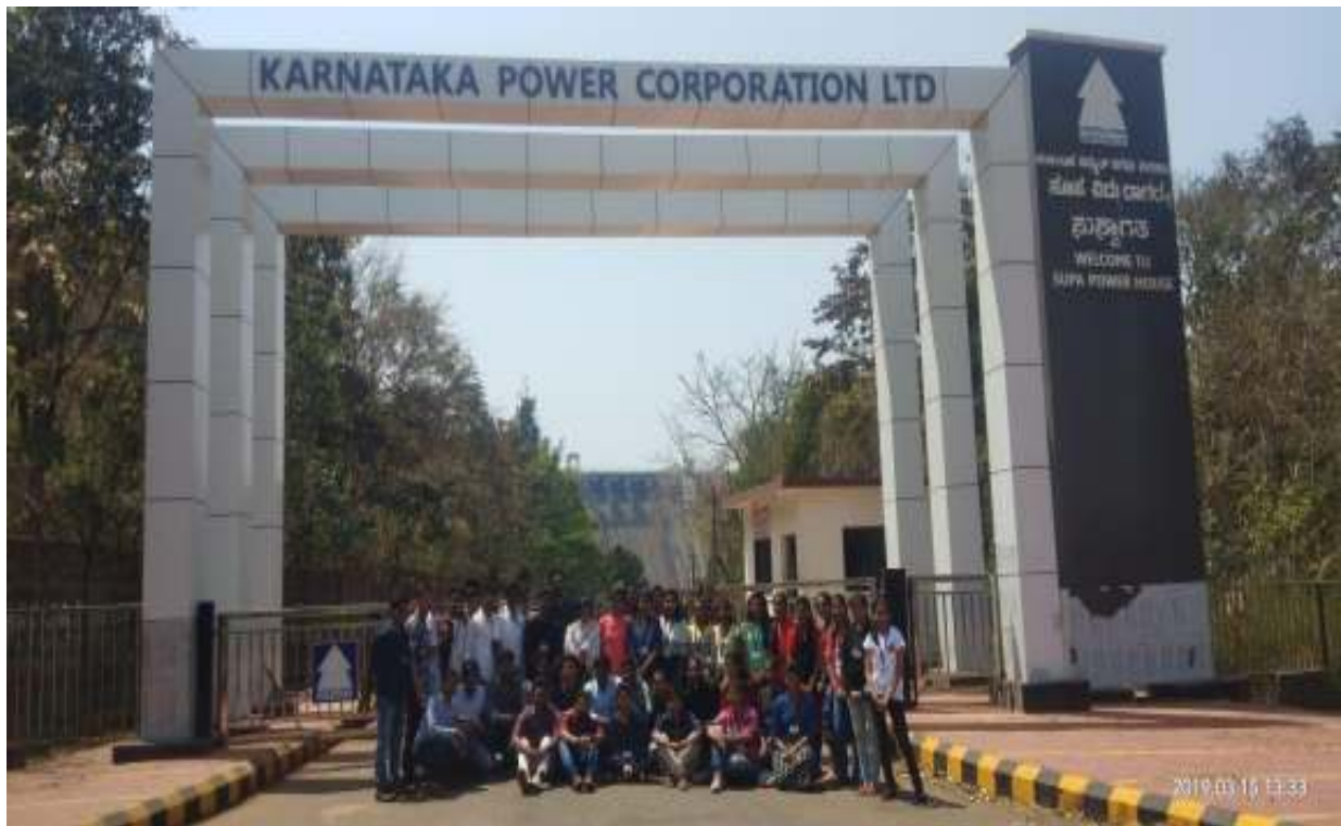
Staff and Students of 8 th semester Electrical and Electronics Engineering Department at Supa Power House