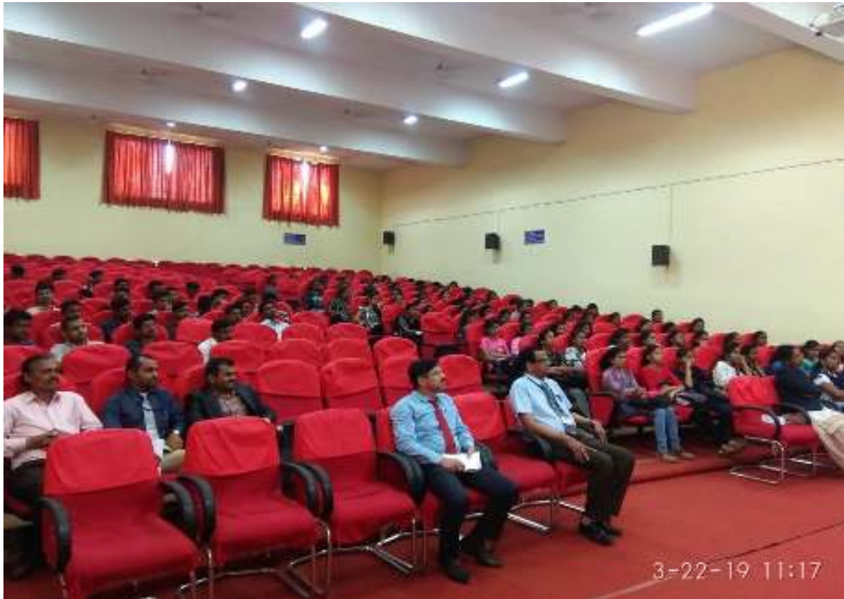
Staff and Students of Electrical and Electronics Engineering Department attending the program