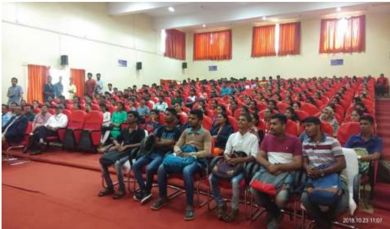
Final year students of SGBIT and Staff attending the Interactive Talk Session