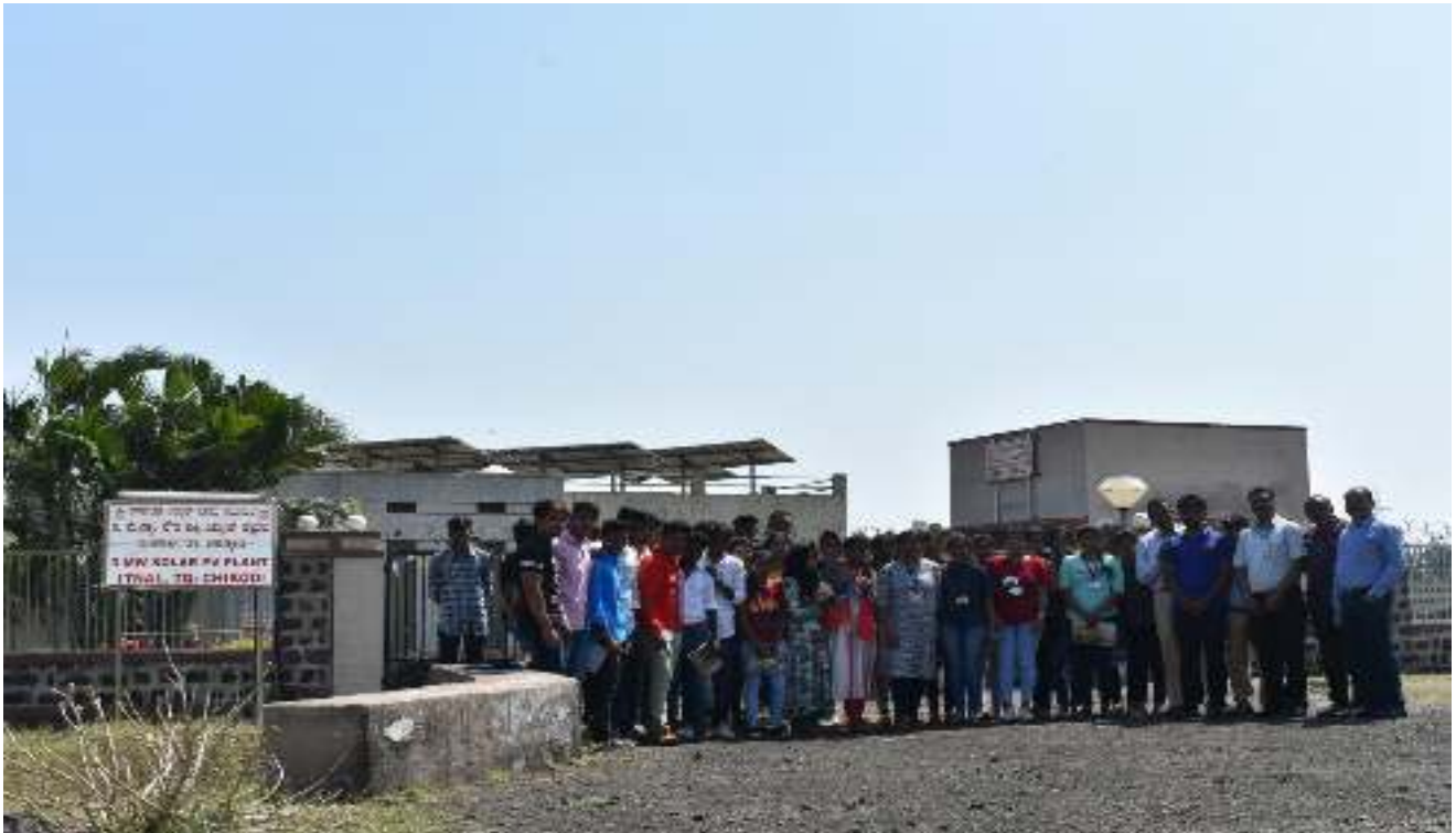
Faculty and Students of 3 rd Semester, EEE Department at Solar Power Plant, Itnal, Chikkodi