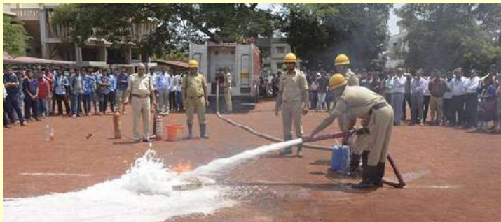
The lecture was followed by demonstration.